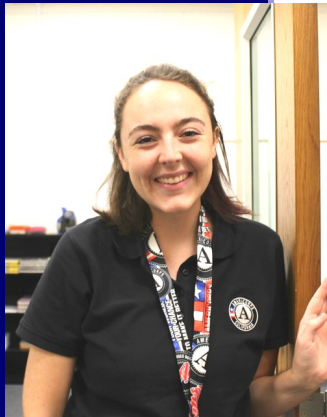
PASS AmeriCorps can be found in Room L3.