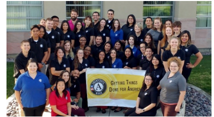
PASS AmeriCorps Team 2017-18

On March 12, PASS AmeriCorps honored our Members by holding a Day of Celebration with team-building activities focused on giving thanks, and a catered lunch. Our Members participated in gratitude and appreciation-based activities, and had the opportunity to connect and build their teamwork and sportsmanship through playing some fun teambuilding games during lunch. Thank you to our PASS